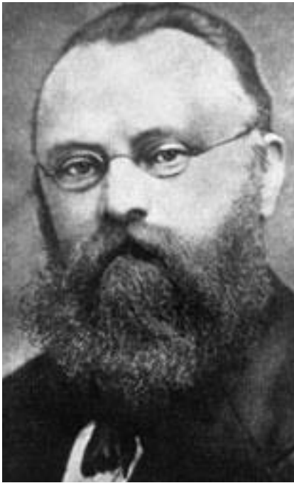
Ernst Wilhelm Liebrecht Tempel

The comet was discovered on December 19th, 1865, by Ernst Wilhelm Liebrecht Tempel in Marseilles, France. Tempel was born in 1821 in Nieder-Kunersdorf, in Saxony. He trained as a lithographer, and took up astronomy as a side interest. When he moved to Venice, he purchased a 4 inch refractor, and started looking for comets from a balcony of a Venetian palace. He found his first in 1859, also the year in which he became the first observer to note the nebula around the star Merope in the Pleiades. In 1860, he moved to Marseilles, France, obtained employment at the observatory, and went on to discover 8 more comets, including the famous Tempel-Tuttle as we now know it. In 1871 he moved to Milan, Italy, taking a job as an assistant to Schiaparelli at the Brera Observatory. He discovered 3 more