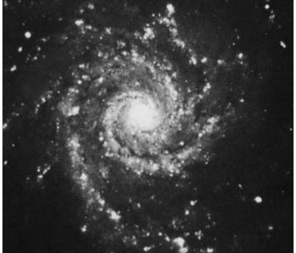
M74, the lone Messier object in Pisces

Observatory, refer to a star atlas or perhaps the monthly sky charts published in Sky & Telescope or Astronomy magazines to trace the line of stars forming the western fish for 35-40 degrees (about 4 fist widths) eastward from the Circllet to reach 4th mag alpha Psc, the “knot” joining the two fish at their tails.